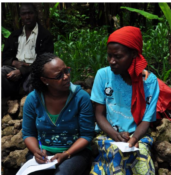
Household data collection, instrument testing with a respondent

NELGA research activities create a link between applied research on land governance and policy processes and generate evidence based knowledge on land governance to inform policy makers.