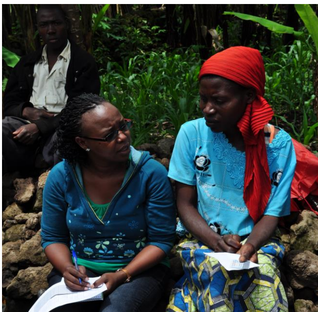
Household data collection, instrument testing with a respondent

NELGA research activities create a link between applied research on land governance and policy processes and generate evidence based knowledge on land governance to inform policy makers.